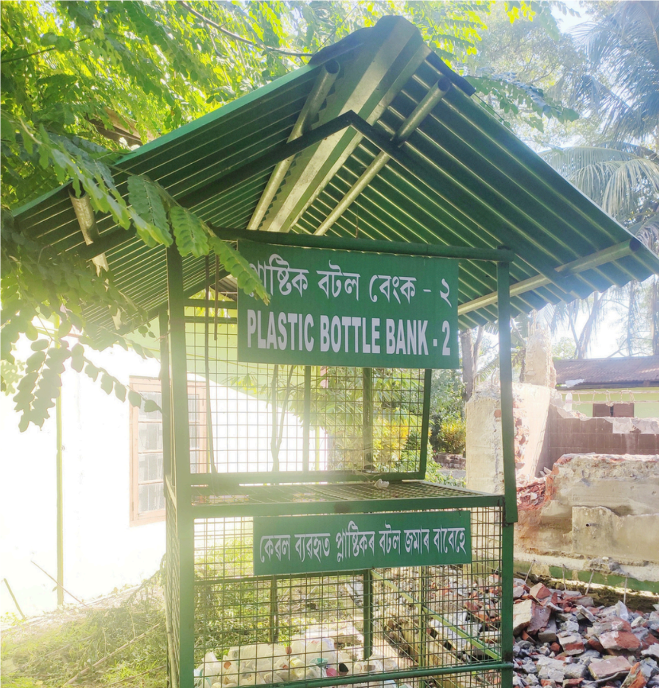
Plastic bottle bank

Gargaon College has strict restrictions regarding the usage of single-use plastics and outright prohibits its use. Increasing environmental awareness is one of the key tasks. By building notice boards and running awareness campaigns, it is achieved. It was recently instituted by the institution to place used water bottles in banks of plastic bottles. These bottles are recycled by students to make flowerpots, home accents, and other practical items. Bags and plastic bottles can also be used to grow seedlings, fill vermicompost to sell, and other purposes.