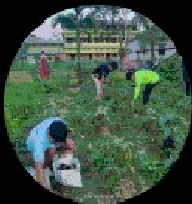
Transfer of saplings to Organic Garden