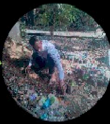
Separation of plastic bottles