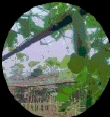
Vegetables grown in Organic Garden