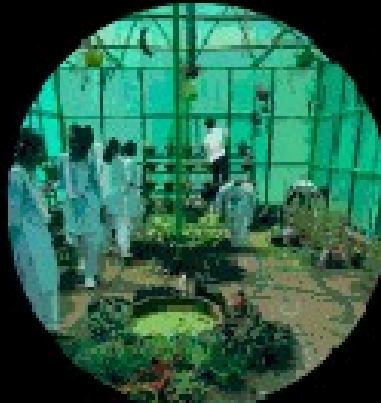
Transfer of saplings to Green House