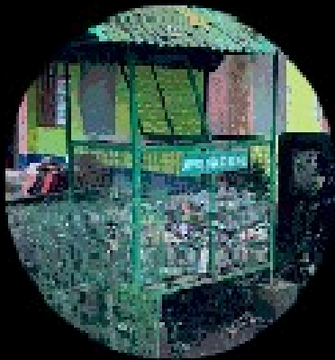
Collection of plastic bottles