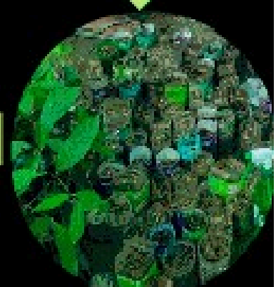
Growth of saplings