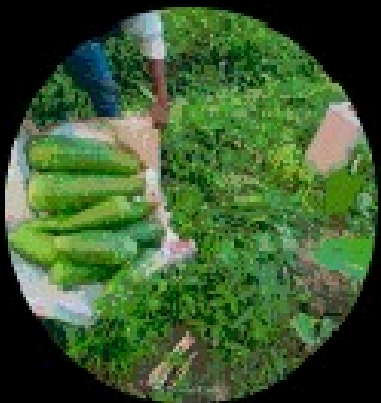
Collection of vegetables for distribution