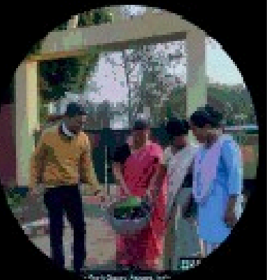
Vegetables distribution to girls hostel