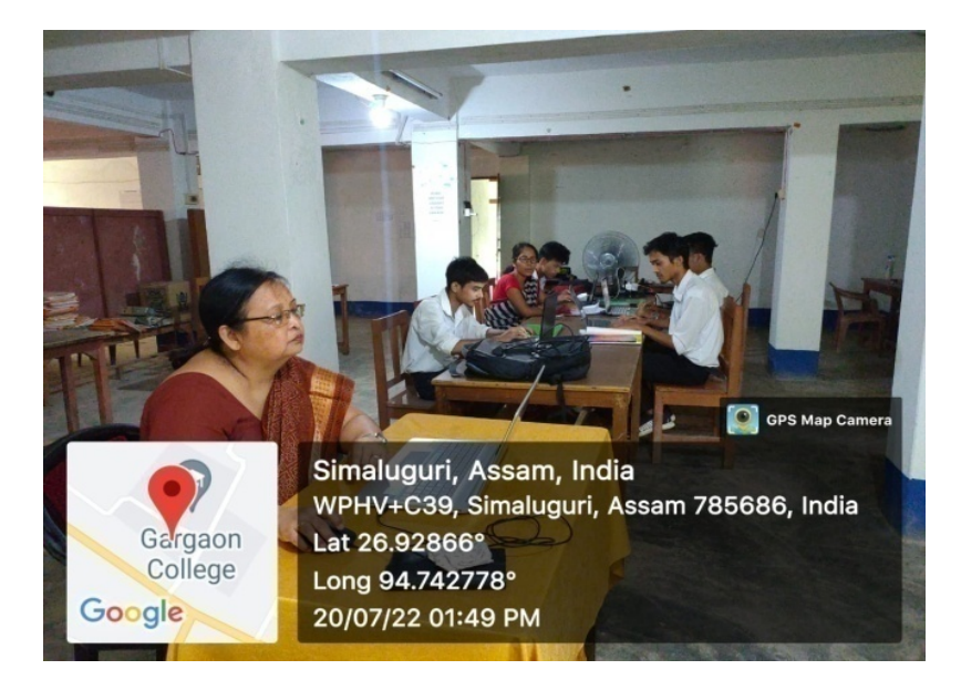
Department of Statistics Gargaon College, Simaluguri