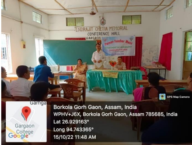
Gargaon Borkola Gorph Gaon, Assam, India WPHV+J6X, Borkola Gorph Gaon, Assam 785685, India Lat 26.929163° Long 94.743365° 15/10/22 11:48 AM