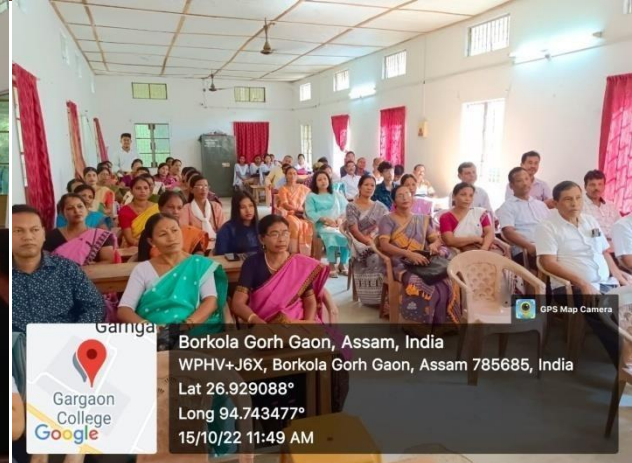
Gargaon Borkola Gorph Gaon, Assam, India WPHV+J6X, Borkola Gorph Gaon, Assam 785685, India Lat 26.929088° Long 94.743477° 15/10/22 11:49 AM