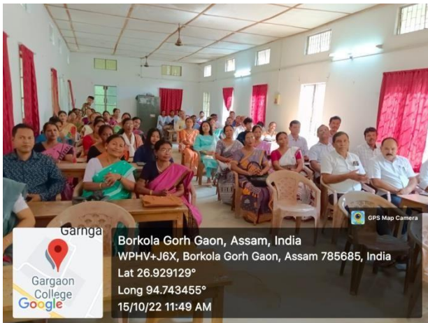
Gargaon Borkola Gorph Gaon, Assam, India WPHV+J6X, Borkola Gorph Gaon, Assam 785685, India Lat 26.929129° Long 94.743455° 15/10/22 11:49 AM