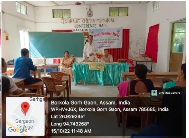
Gargaon Borkola Gorph Gaon, Assam, India WPHV+J6X, Borkola Gorph Gaon, Assam 785685, India Lat 26.929245° Long 94.743268° 15/10/22 11:48 AM