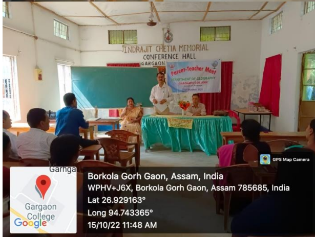
Gargaon Borkola Gorh Gaon, Assam, India WPHV+J6X, Borkola Gorh Gaon, Assam 785685, India Lat 26.929163° Long 94.743365° 15/10/22 11:48 AM