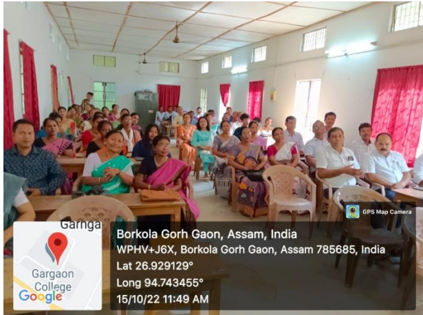
Gargaon Borkola Gorh Gaon, Assam, India WPHV+J6X, Borkola Gorh Gaon, Assam 785685, India Lat 26.929129° Long 94.743455° 15/10/22 11:49 AM