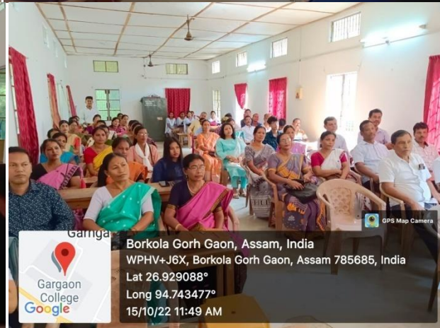
Gargaon Borkola Gorh Gaon, Assam, India WPHV+J6X, Borkola Gorh Gaon, Assam 785685, India Lat 26.929088° Long 94.743477° 15/10/22 11:49 AM