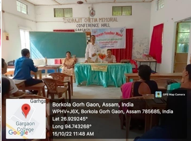
Gargaon Borkola Gorh Gaon, Assam, India WPHV+J6X, Borkola Gorh Gaon, Assam 785685, India Lat 26.929245° Long 94.743268° 15/10/22 11:48 AM