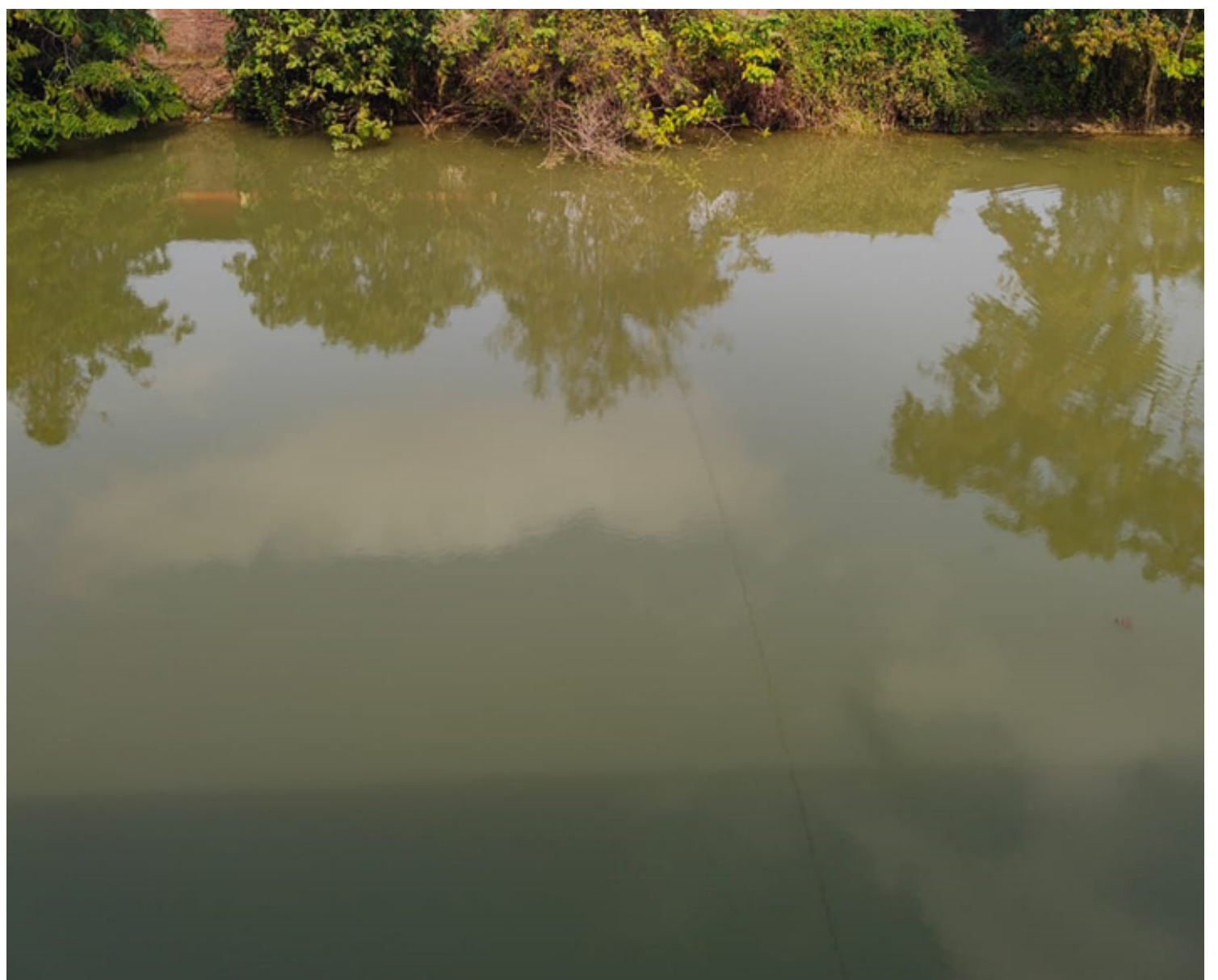
Rain water harvesting for recharging of ground water