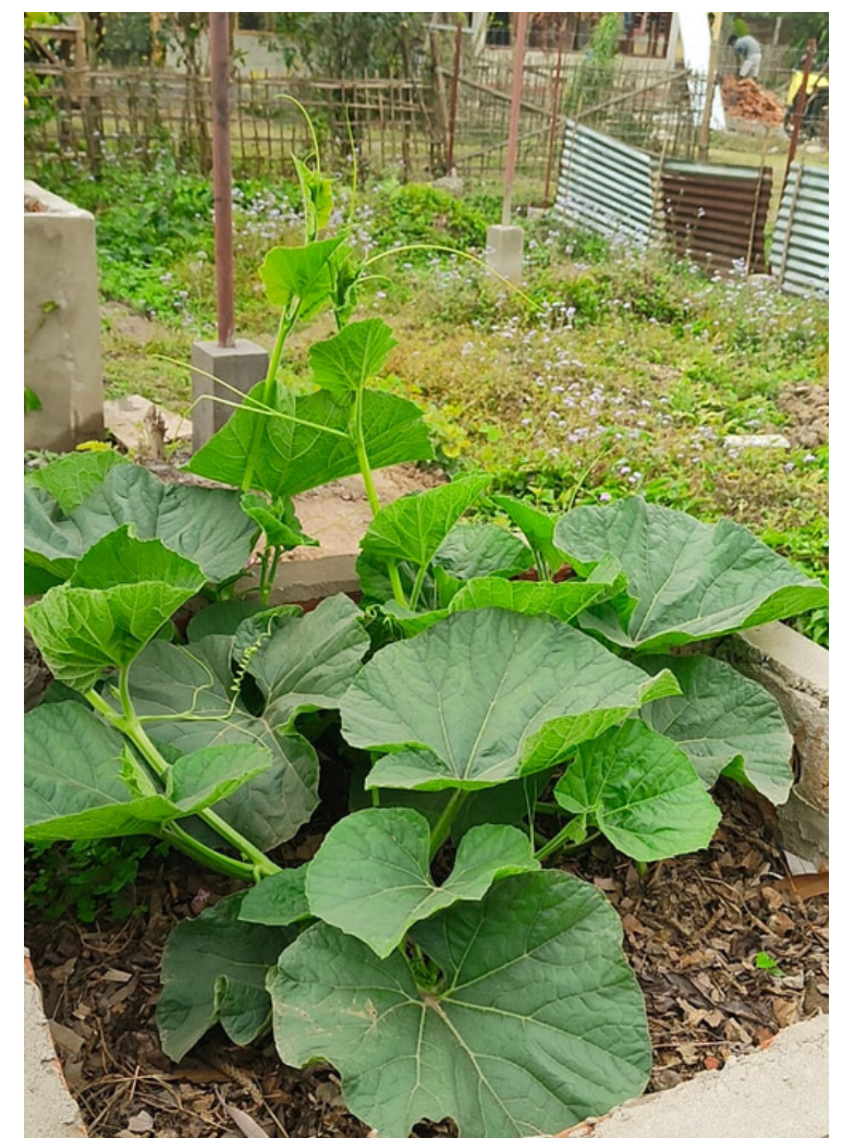
Organic Farming at college