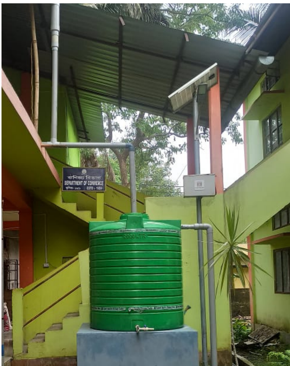
Rain water harvesting unit