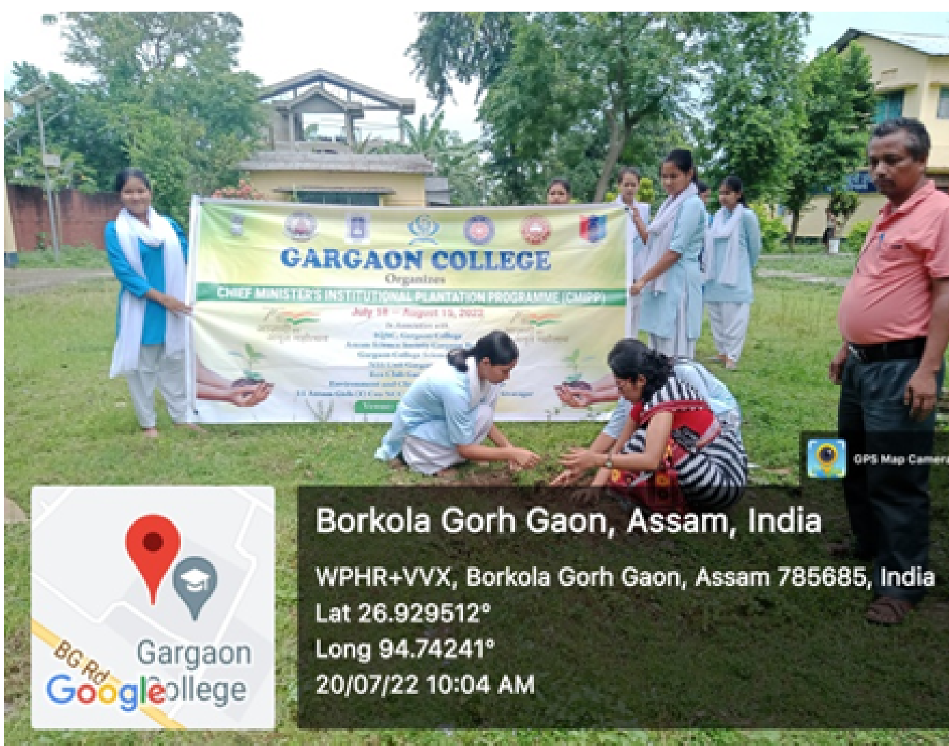
Plantation drive by students & teachers to conserve soil